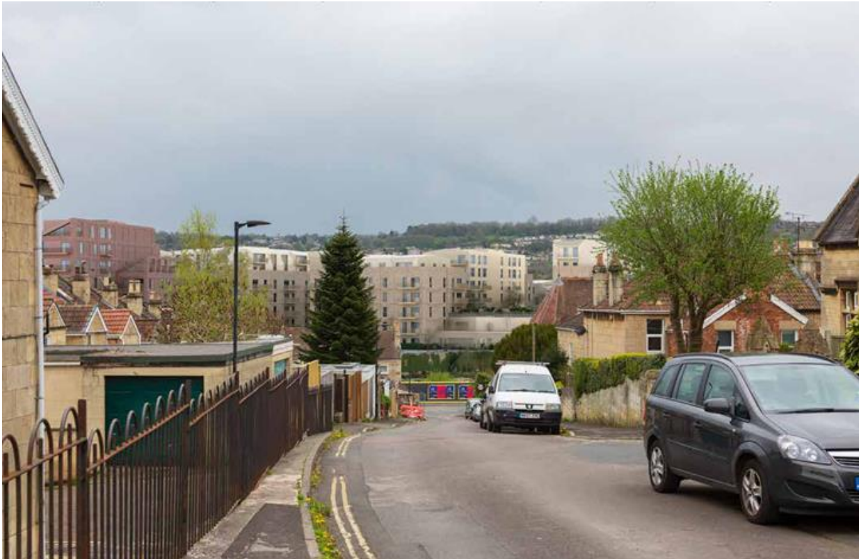
Fig. 2: Existing & Proposed Views, St Michael's Road