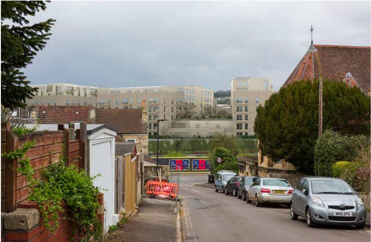
Fig. 3: Existing and Proposed Views, Cork Terrace