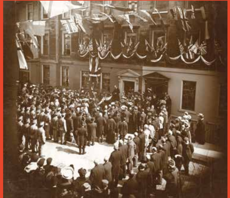
Unveiling a bronze plaque to Admiral Lord Nelson 2, Pierrepont Street, Bath in 1900 © Bath in Time.

Almost everyone had heard of the famous but mystical healing properties of Bath's thermal spring waters, and Nelson believed the stories implicitly. Accordingly, the Bath Journal of 22nd January 1781 proclaimed Nelson's arrival in the town in its customary roll-call of visiting dignitaries.