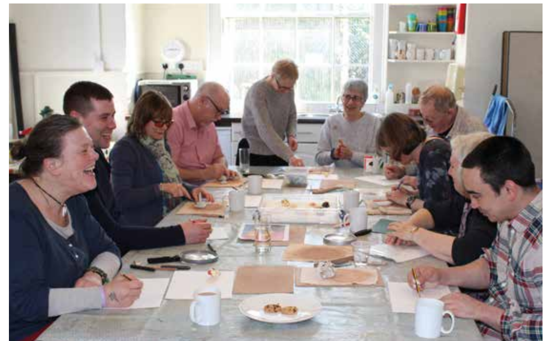
Above: Gardener's Lodge Art Group, 2018