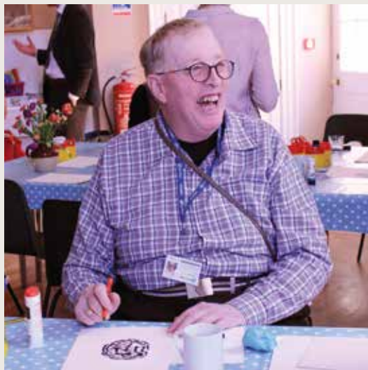
Left: A Pathways to Wellbeing participant enjoys a Creativity and Wellbeing coffee morning, 2017

Over the life of the project May 2016 to Feb 2019