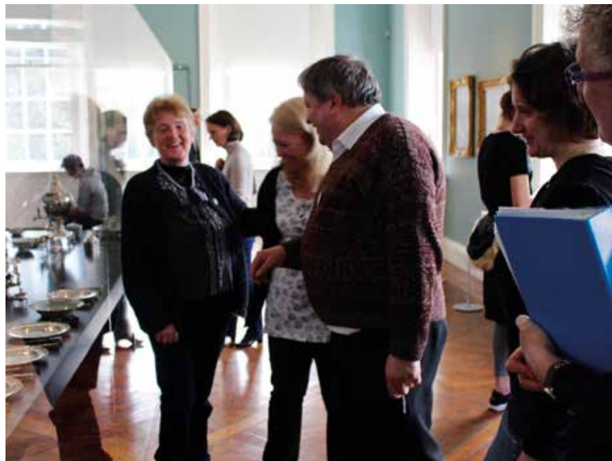
Right: A Discover Museums mentee shares his knowledge of the collection, 2016