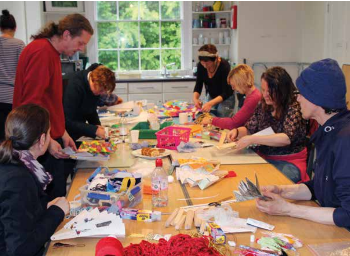
Above: Gardener's Lodge Art Group, creating fans inspired by the collection, 2017