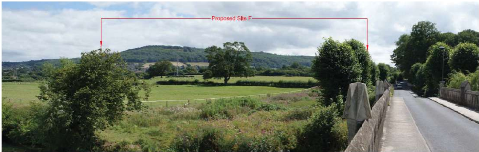
Key Viewpoint 1. View south east towards proposed Site F from Mill Lane toll bridge over the River Avon