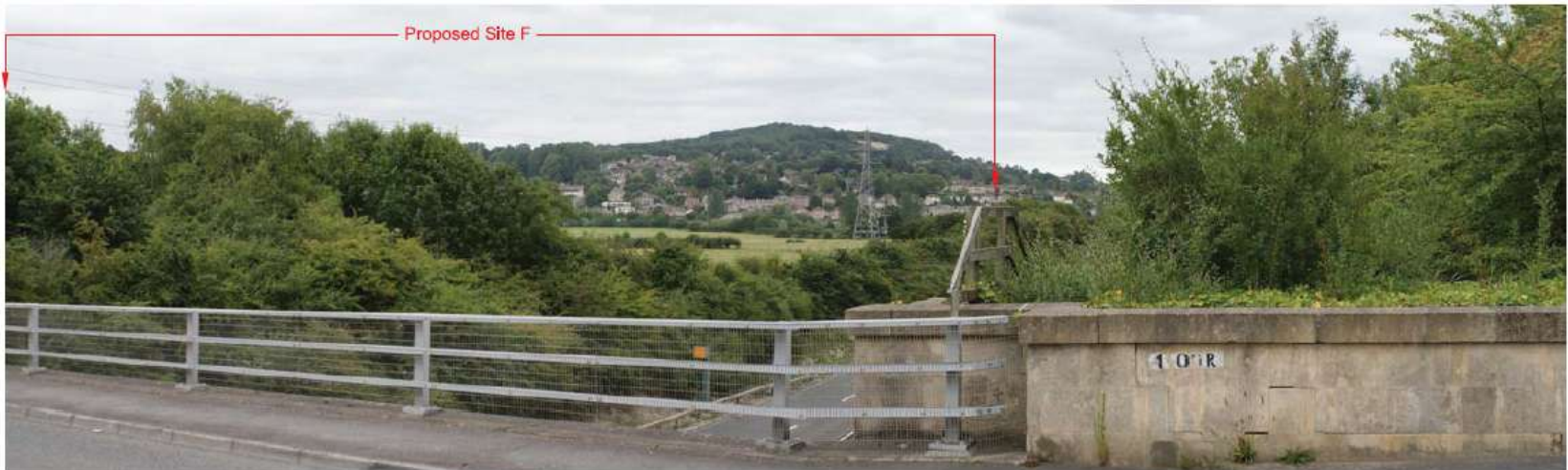
Key Viewpoint 2. View north east towards proposed Site F from Mill Lane bridge over the A4